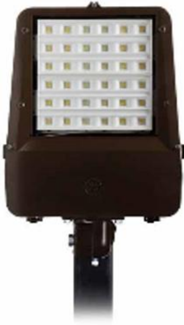
250W EQ and 400W EQ