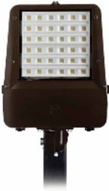
250W EQ and 400W EQ