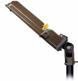
250W EQ and 400W EQ