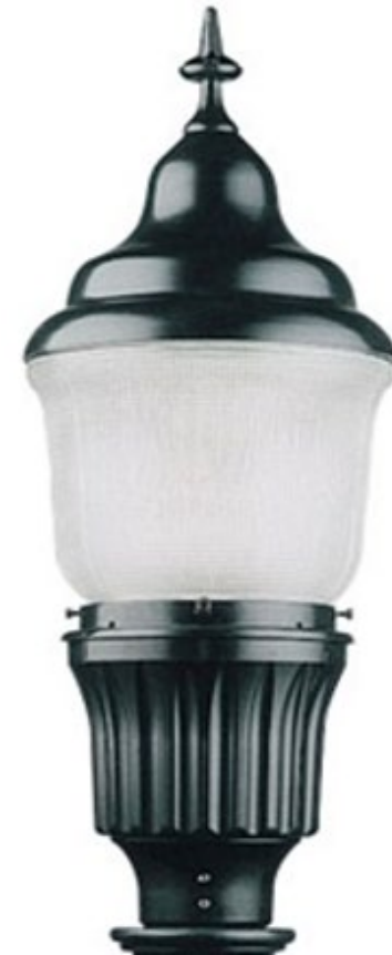
Dark Sky Compliant (DSC)