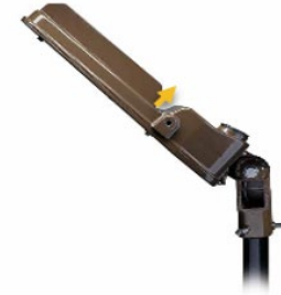
250W EQ and 400W EQ