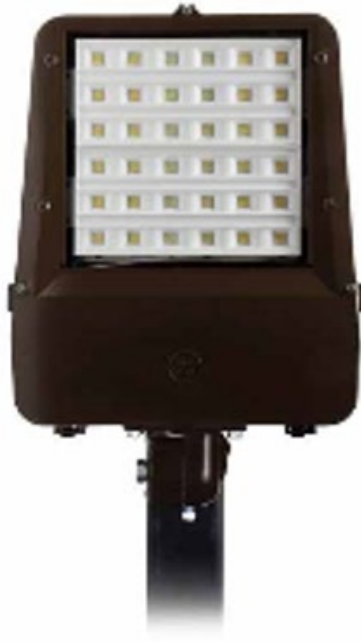
250W EQ and 400W EQ